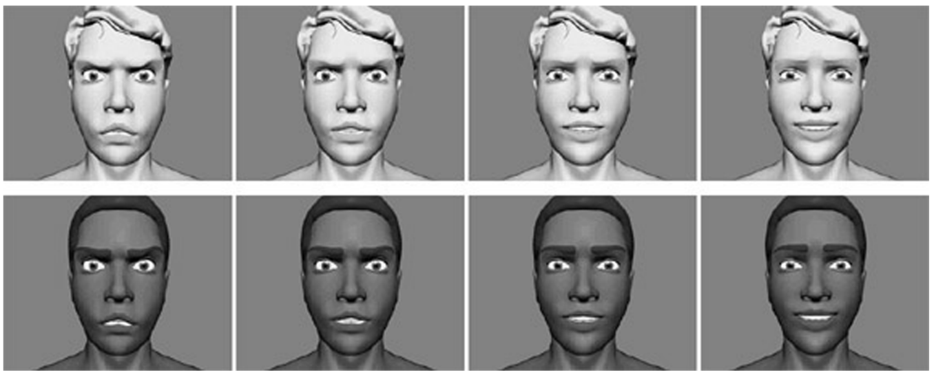
Fig. 1. Four frames of one angry-to-happy movie with the White (top) and Black (bottom) target faces. The figure shows gray-scale reproductions of the original color images.

The main dependent measure was the mean time taken by participants to detect the offset of hostility; longer response latencies indicated lingering perceptions of anger in a particular face. We hypothesized that high-prejudice European Americans would take longer than their